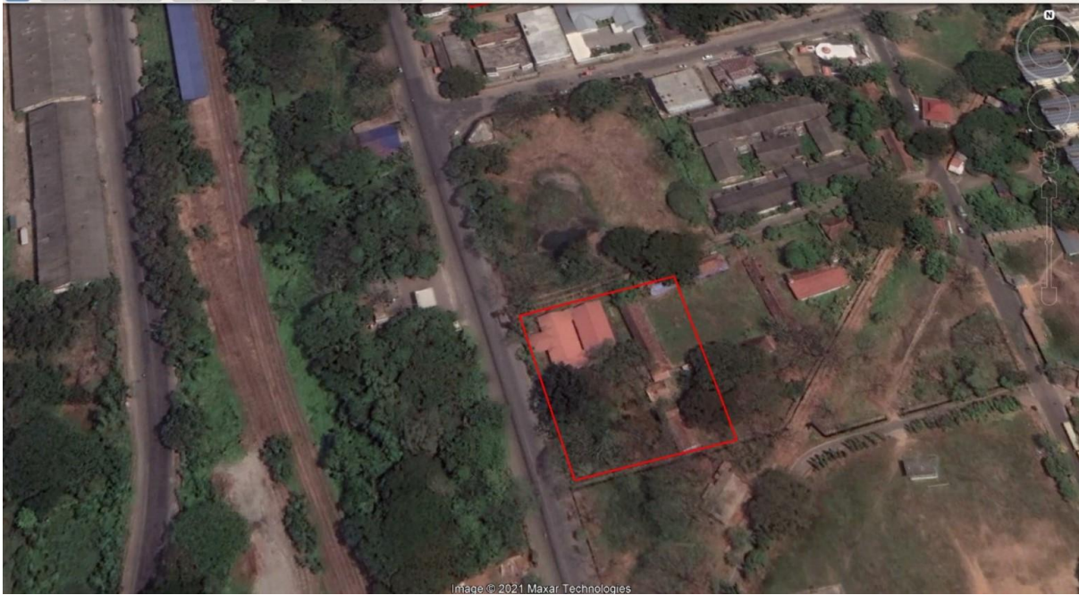
Plot-6: Old IMU Premises (with Bldg.) 0.4047 ha, Bristow Road, Armoury Jn.